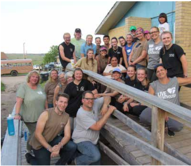
RECENT NEWS & HIGHLIGHTS