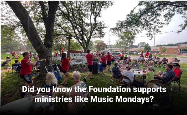
Did you know the Foundation supports ministries like Music Mondays?